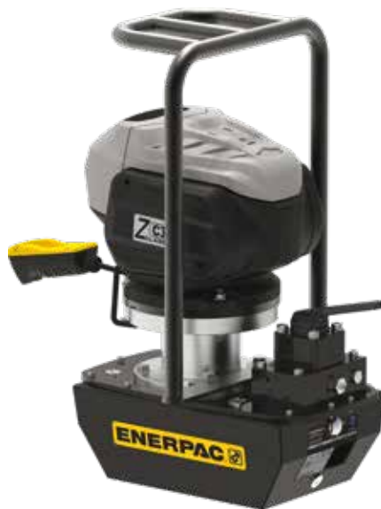
ZC-Series, Cordless Hydraulic Pumps ZC3308E with manual valve