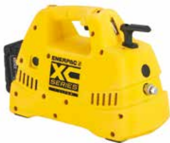
XC-Series, Cordless Hydraulic Pumps XC1201ME with manual valve