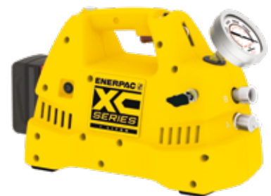
XC-Series, Cordless Hydraulic Pumps XC1502TE with remote pendant (pendant not pictured)

9619GB © Enerpac 09-2018. Subject to change without notice.